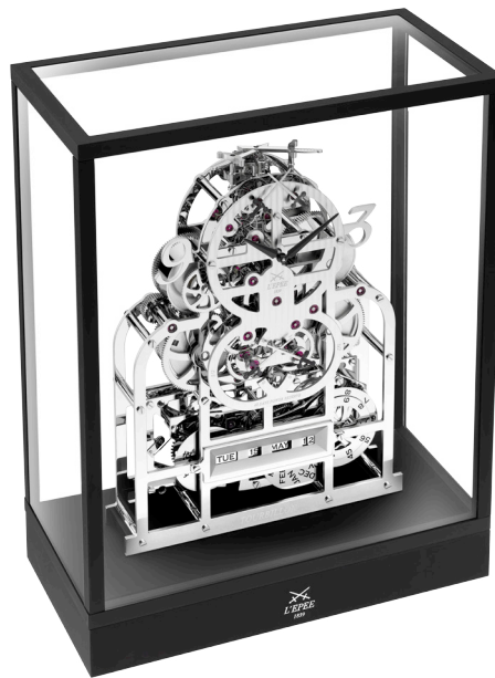
50.6593/201 Le Duel Perpetuel Tourbillon

Manual-winding: Design key to set time and wind